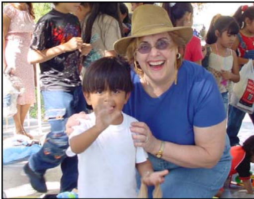
■ Our new friends want to say "Hello!"