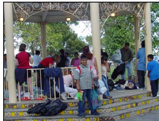
■ There was no lack of excitement, thanks to our generous contributors.