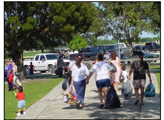
■ Families were delighted to receive much needed clothes, shoes, toys and supplies.

In a land of soybeans and corn and strawberries and alfalfa, lives had been touched by God. Souls had been saved. And a new