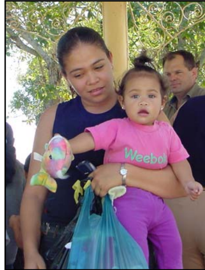
■ Babies find delightful toys.

It was a beautiful, sunny day to be in the Everglades area, and quite beyond the weather it felt like many strongholds had been broken. Even the carpet of broken