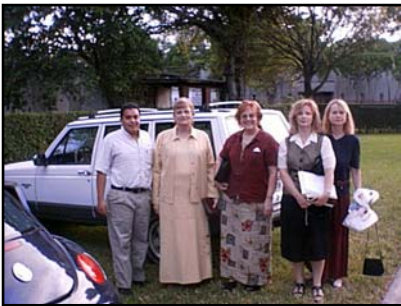
■ Ministry to local Haitian Church

The Board decided to terminate the radio ministry in order to launch our web site, www.marycraig.org. This decision increased our media outreach worldwide and has resulted in much fruit for the Lord, as many of you can attest. People contact us, email, visit Craighouse, and even