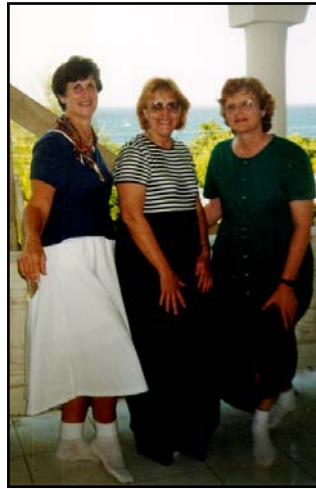
■ Mission team in Jamaica