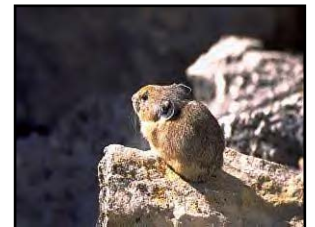
■ The Cony

"The conies (rock badgers) are but a feeble folk, yet make they their houses in the rocks..." Proverbs 30.26